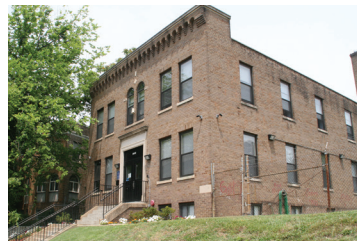
La Casa Transitional Rehabilitation Program