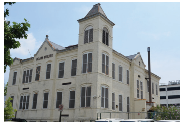
Blair Transitional Rehabilitation Program