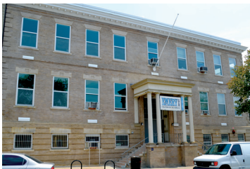
Emery Work Bed Program (currently undergoing renovation)