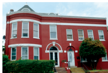
Sherman Avenue Single Room Occupancy