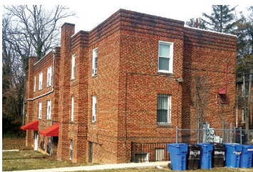
Anacostia Road Apartments