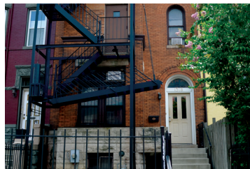
Park Road House